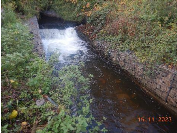
Monitoring Point 4 – 15 th November 2023