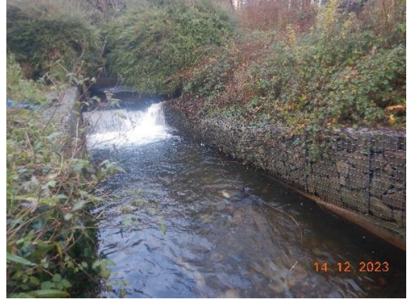
Monitoring Point 3 – 14 th December 2023