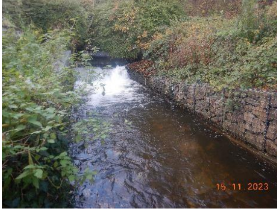
Monitoring Point 3 – 15 th November 2023