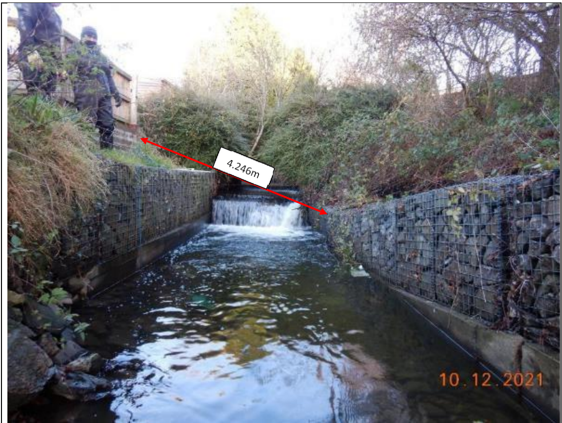
Distance from Block Wall to Gabion opposite